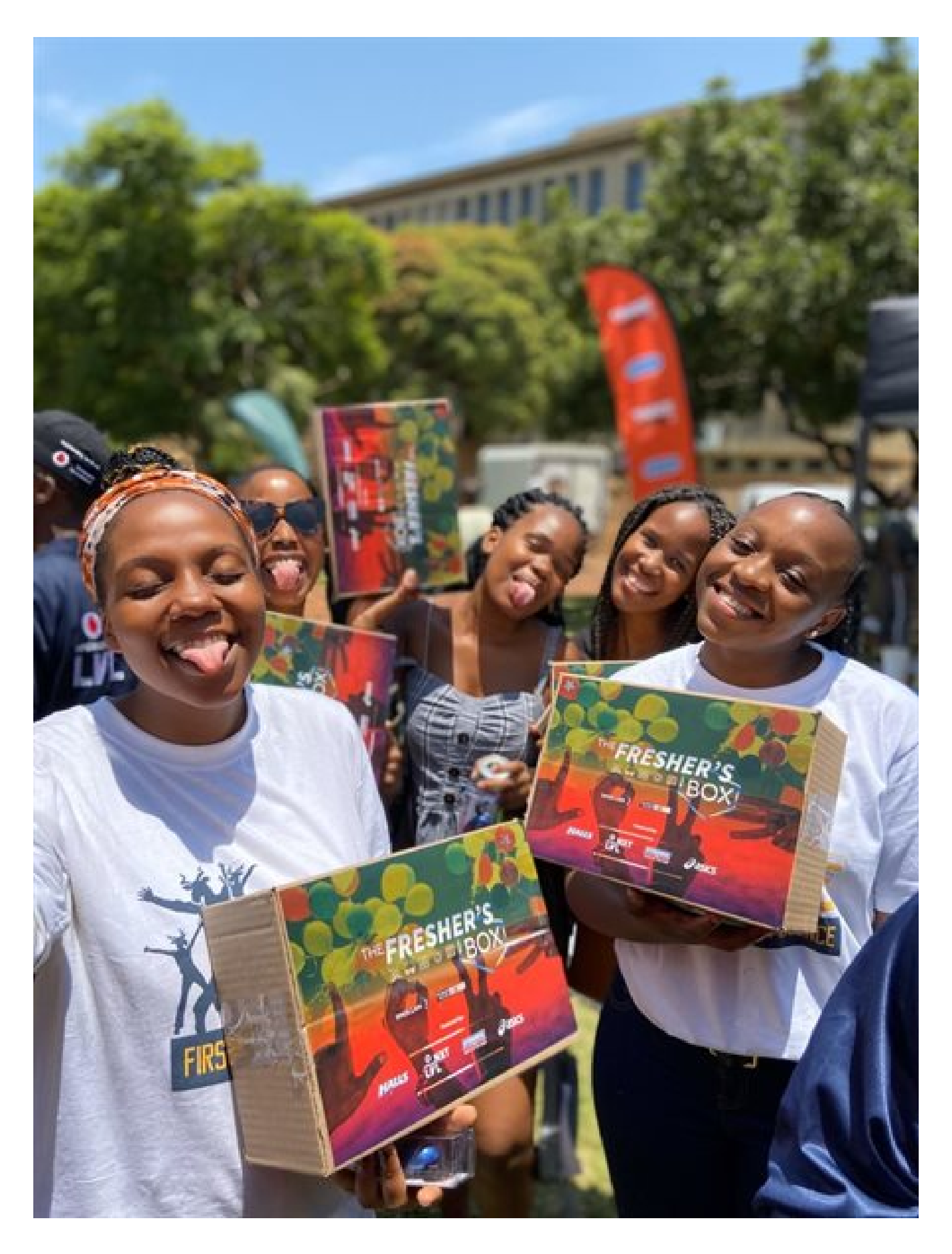
Now that we're on the same page, there's only one teeny tiny question: where to from here? Lockdowns and new variants aside, brands and students still need to connect.