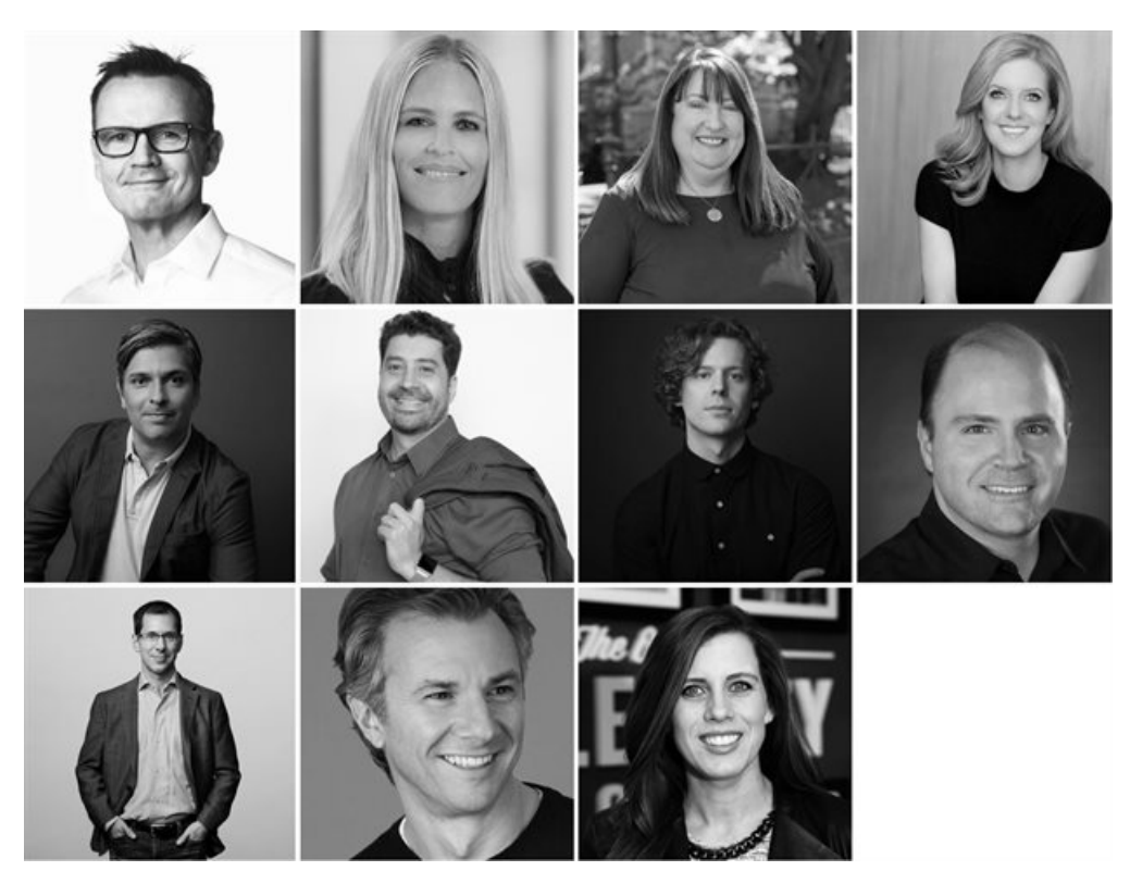
The One Show's 2020 CMO Pencil jury.

The One Club for Creativity today announced the first group of global brand marketers who will serve on <u>The One Show</u>'s 2020 <u>CMO Pencil jury</u>.