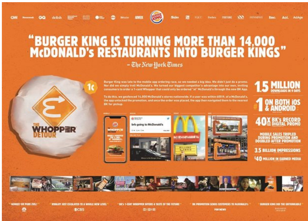
Cannes Lions 2019 Titanium Grand Prix winner, 'Whopper Detour'.

The entries span 9 countries, including: Colombia, France, Germany, Poland, Spain, Israel, UAE, UK and USA with presentations taking place on Tuesday, 18 and Wednesday, 19 June and winners awarded onstage on Friday, 21 June.