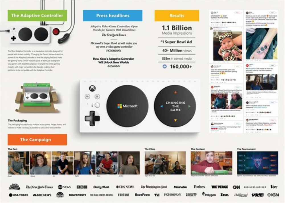
Brand Experience & Activations Grand Prix winner, Microsoft Xbox 'Changing the Game'.

Rock Paper Scissors, New York; Company 3, New York; JSM Music, New York; and Sonic Union, New York; with media by Carat, New York; PR by WE Communications, Seattle; and additional work by Microsoft, Redmond on 'Microsoft Xbox: Changing the Game'.