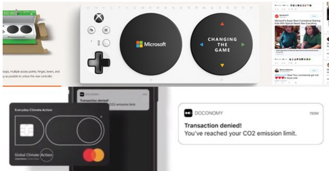
Cannes Lions 2019 Experience Grand Prix winners - 'Microsoft Xbox: Changing the Game' under Brand Experience & Activations; Doconomy's 'Do Black - The Carbon Limit Credit Card' under Creative eCommerce...

The 66th annual Cannes Lions Festival of Creativity continued on 20 June with the 2019 Cannes Brand Experience & Activation and Creative e-Commerce winners announced during the Experience track award ceremony.