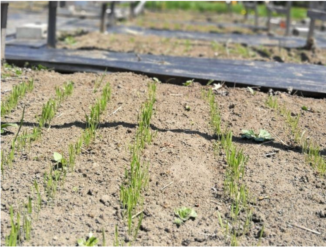
Our experimental field with wheat as a model plant to investigate the effect of drought on the plant microbiome. Ruth Schmidt

Part of our research involves finding ecologically friendly alternatives for agriculture. For example, microbial terpenes — the biggest class of volatiles produced by fungi , protists and bacteria can help plants survive in times of drought. The microbes release these volatiles to signal the plants and stimulate the plant's defensive mechanisms .