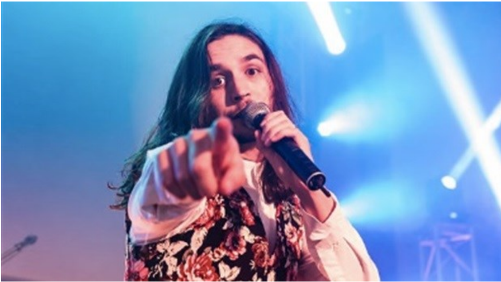
The Kiffness made sure everyone was dancing the night away

Over R240k was raised with additional fundraising efforts still under way. If you didn't get a chance to contribute to this year's beneficiaries, you can do so by clicking here . For more information on the charities, click on the links of the relevant organisations below.