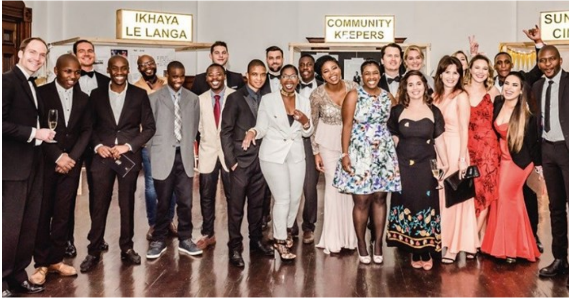
Beneficiaries of 2017 5 for Change fundraiser

This year the organisers chose to showcase Ikhaya Le Langa (Home of the Sun), Numeric, Sunshine Cinema, Dine With and Community Keepers as the beneficiaries of the proceeds raised by the event. View the image gallery here .