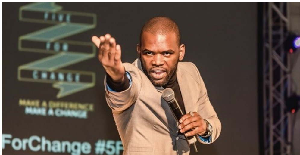
Comedian Siv Ngesi was the MC