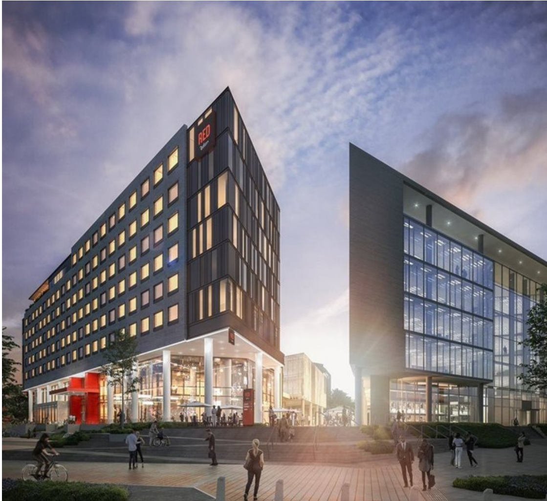
Radisson RED Johannesburg Rosebank

The Radisson Hotel Group has signed its second Radisson Red in South Africa. Scheduled to open in February 2021, the Radisson Red Hotel Johannesburg, Rosebank, brings the groups' African portfolio to almost 100 hotels in operation and under development.