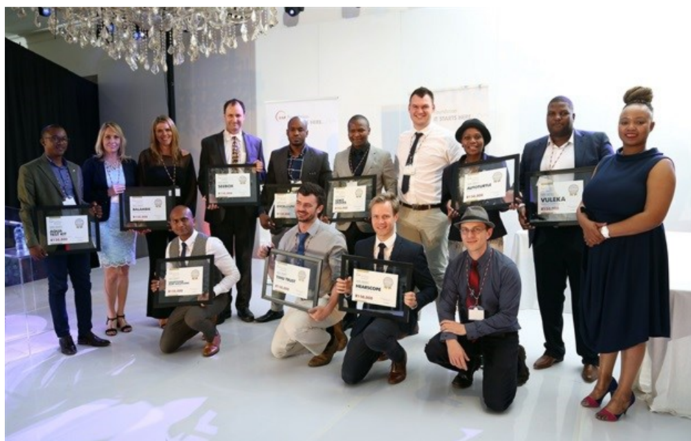
SAB Foundation Social Innovation Award winners 2017