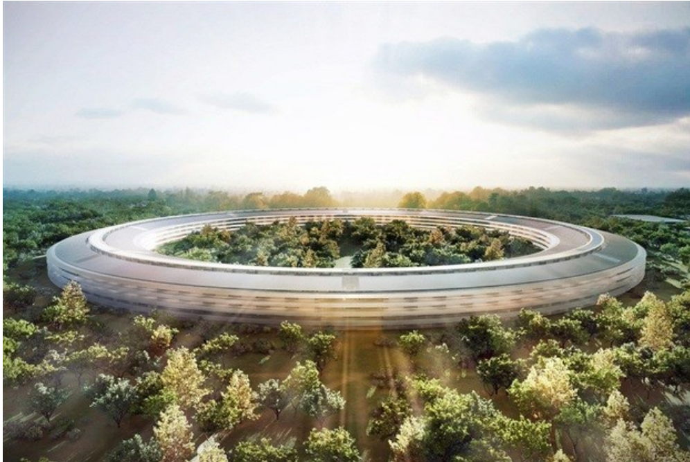
Foster + Partners-designed campus in California.

Apple has announced new plans to build a $1bn campus in Austin, Texas, alongside its new sites in Seattle, San Diego and Culver City. The company aims to expand its new operations in cities across the United States, including Pittsburgh, New York and Boulder, Colorado over the next three years.