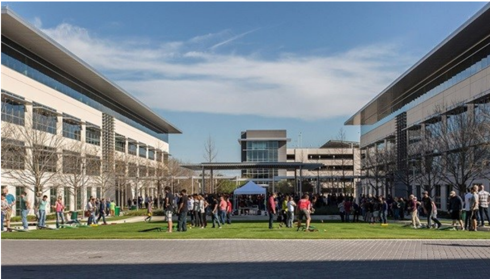
The company's current facilities in Austin accommodate 6,200 staff, marking Apple's largest presence of employees outside of Cupertino.

"Apple is among the world's most innovative companies and an avid creator of jobs in Texas and across the country," said Texas governor Greg Abbott.