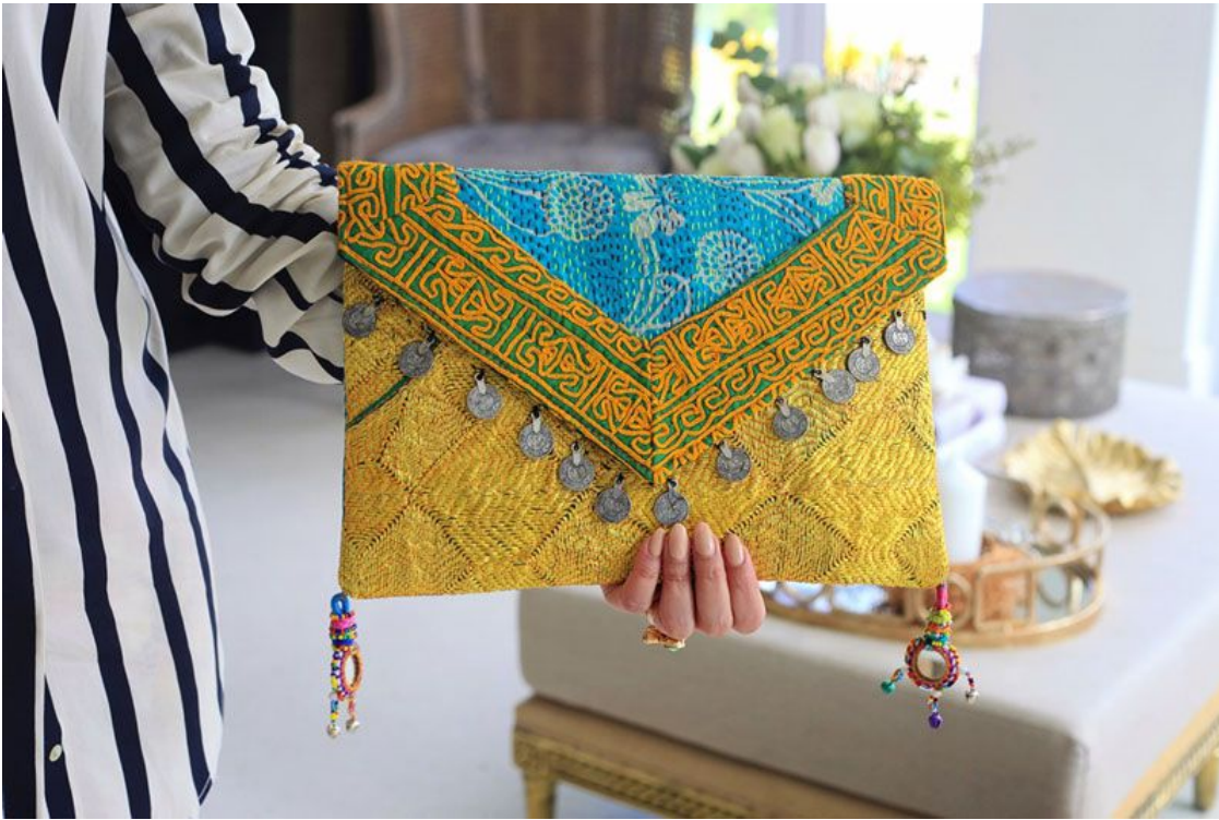
Banjara Cluth made from vintage off cut fabrics