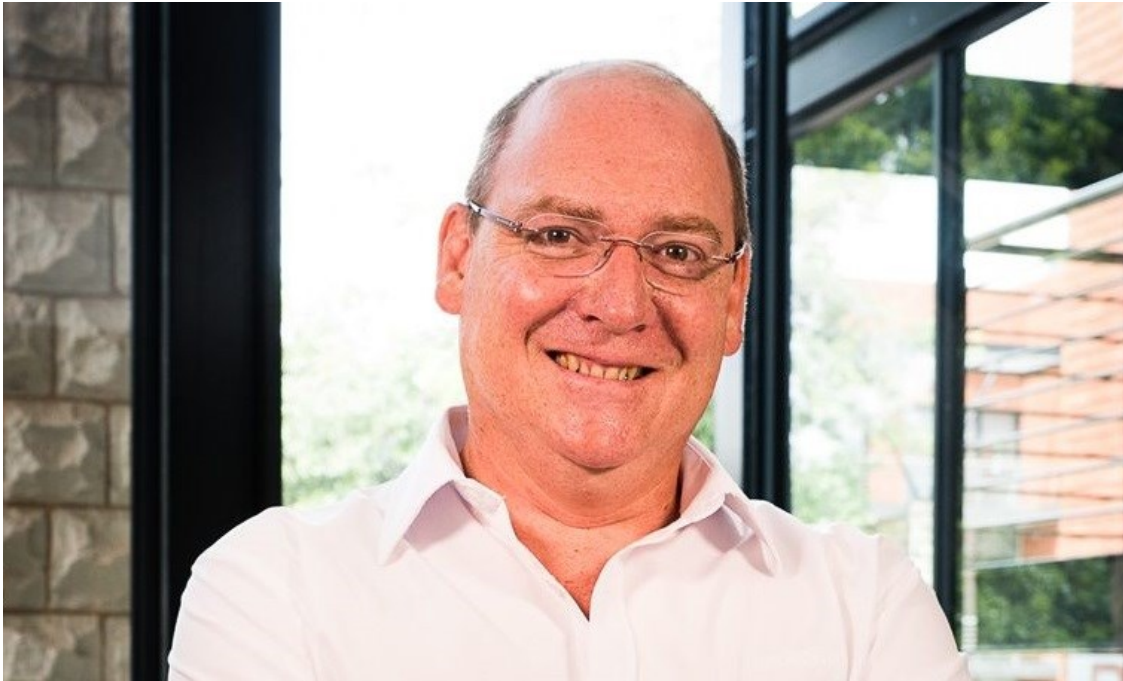
Director of Sales Engineering at Mimecast

As we enter the new year, it's worth taking stock of the opportunities - and the likely cybersecurity threats - lying ahead.