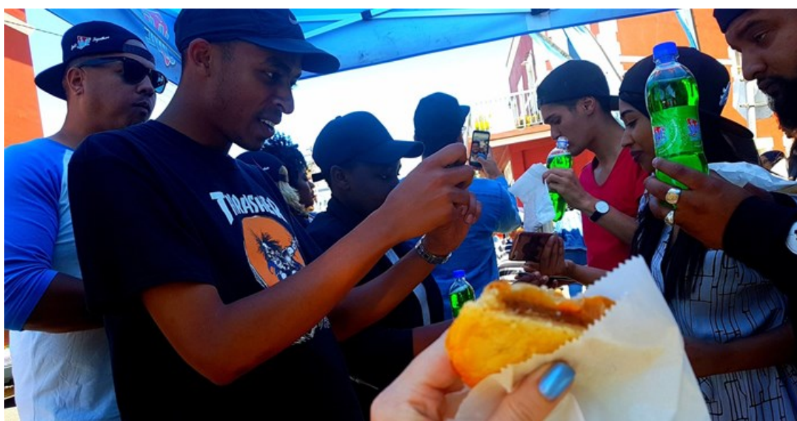
Everybody Instagramming the experience.

ne of day and pair especially well with Jive Cream Soda, which has a more-ish vanilla vibe that took many an influencer back to their early kiddies' party days.