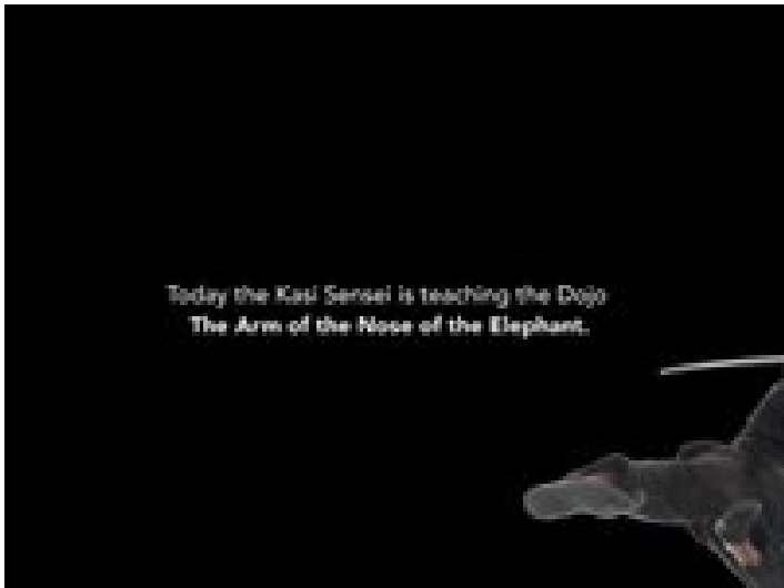
Film Crafts - Craft Gold