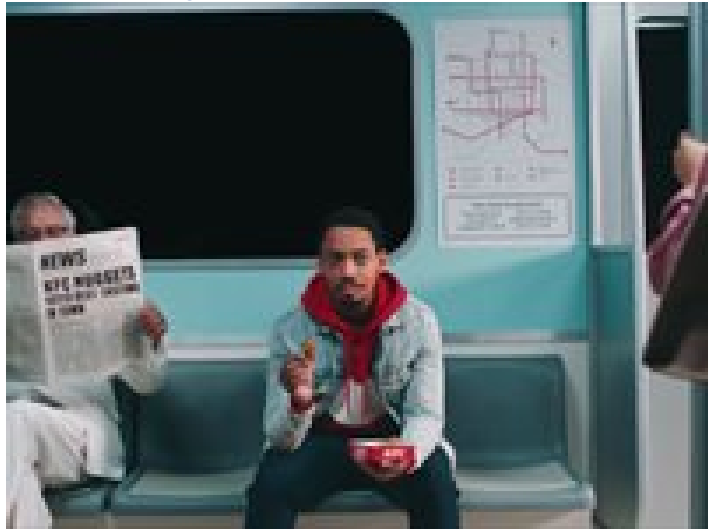
Film Crafts - Craft Certificate