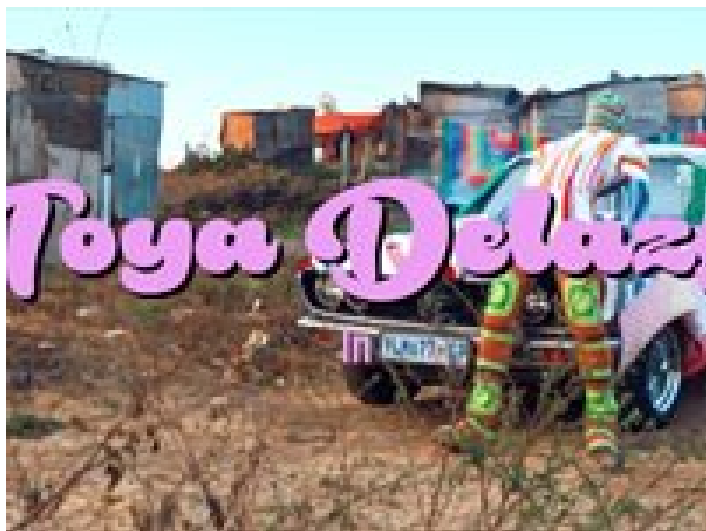
Film - Bronze

The Loeries concluded the 2020 awards with Film, Film Craft, Grand Prix, Brand of the Year, Agency of the Year award, Regional Agency Group of the Year awards. Throughout Loeries Creative Week, a total 264 Loeries were awarded across 16 categories, including five Grands Prix, 28 Golds, 63 Silvers, 110 Bronzes, 14 Craft Golds and 44 Craft Certificates. The awards honour the best in brand communications across Africa and the Middle East. Here is the gallery of winners from day five.