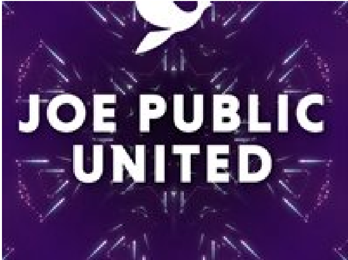
Agency of the Year Award