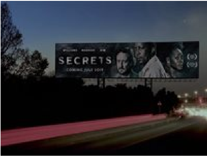
Grand Prix - Grand Prix