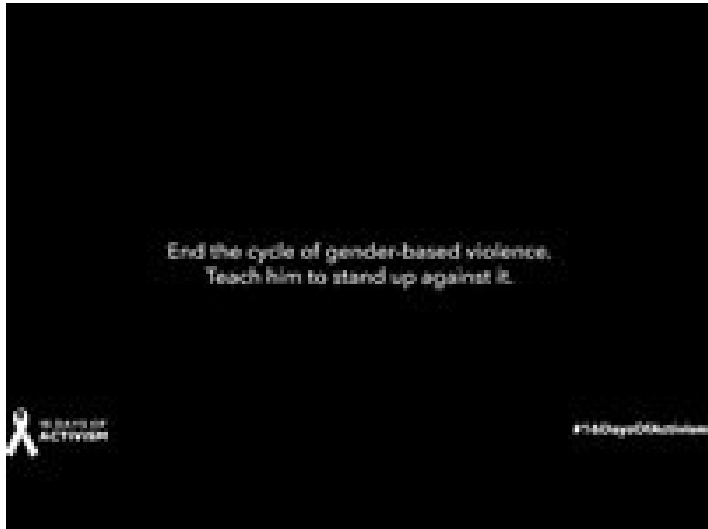
Film Crafts - Campaign Craft Certificate