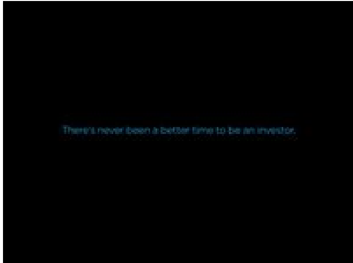
Film Crafts - Craft Certificate