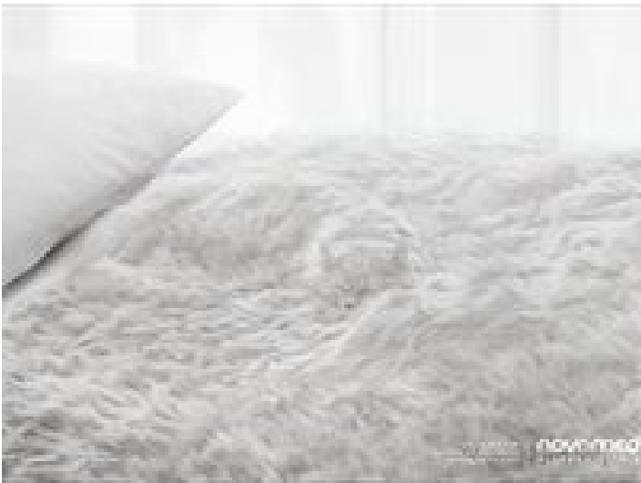
Grand Prix - Grand Prix