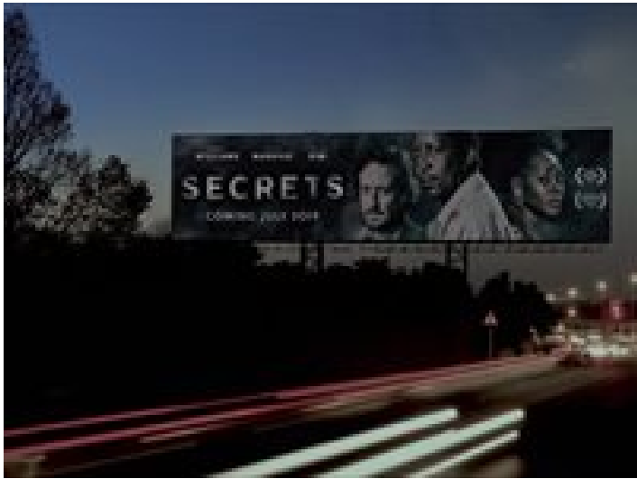
Film - Gold