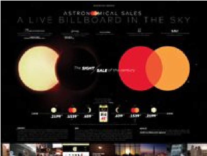
Grand Prix - Grand Prix