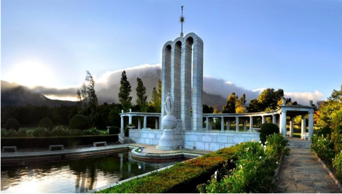
Franschhoek Wine Valley will host Art & Wine Franschhoek as well as the Franschhoek Open Gardens Festival this October.

Franschhoek Wine Valley is home to award-winning wines, internationally acclaimed restaurants, exquisite art and a range of cultural and outdoor offerings. This October, make the most of your visit as it coincides with Art Franschhoek and the Franschhoek Open Gardens Festival.