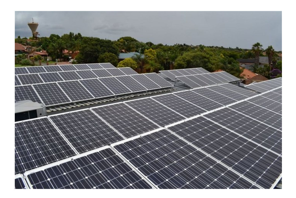
In the 2023 financial year, the group achieved