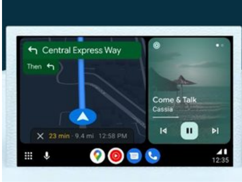
Android Cool Walk

Android Auto was available as a standalone Android phone app until Google removed support for it from phones in 2022, opting instead to fold in the media controls into a “driving mode” version of Google Maps.