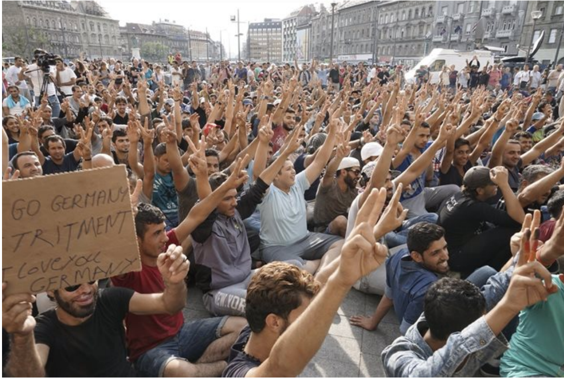
Syrian refugees strike in front of Budapest Keleti railway station in Hungary. 3 September 2015.

Russia's invasion of Ukraine in late February has already caused two million refugees to flee the country. The United Nations High Commissioner for Refugees predicts that another four million will be displaced if the conflict continues .