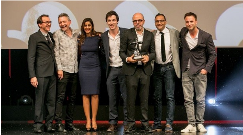
BBDO at Loeries 2017.

Just when you thought the Loeries buzz was over, the Loeries' rankings are in! I chatted to some of this year's top-ranked creatives post-celebrations. We continue the global and local insights with BBDO.