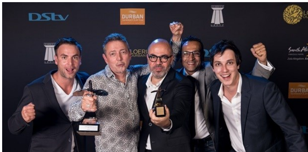
BBDO at Loeries 2017.

It's always great to win Loeries, they're an important part of our year. They give us the ability to judge ourselves against our peers, as the awards act as a magnet for talent and they give our clients the credit they richly deserve.